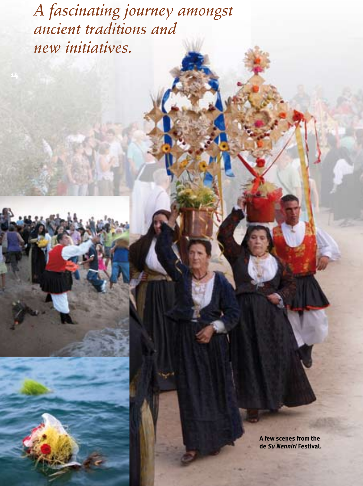
A few scenes from the de Su Nenniri Festival.