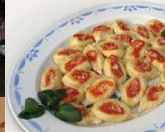
The culurgionis are the dish that most characterizes the local cooking of Ogliastro.