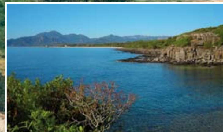
The little cove of S'Abba 'e S'Ulimu with the dark basalt cliffs.

sea stacks of red porphyry called Is Iscoglius Arrubius , ( Arrubius means “red”), which stand out against the horizon with an unusual color contrast. Continuing southward, the sandy coast is abruptly interrupted by the dark cliffs of Punta Niedda , Punta Su Mastixi , and the little cove of S'Abba e s'Ulimu . These cliffs form the farthest part of the basaltic plateau of Teccu and are totally unique for the entire coastline of Ogliastra. Exploration of the characteristic seabeds created by the hardened flows of basaltic rocks is particularly appreciated by snorkeling and diving fans, but the richness of the seabeds is a great attraction for those who practice underwater fishing as well.